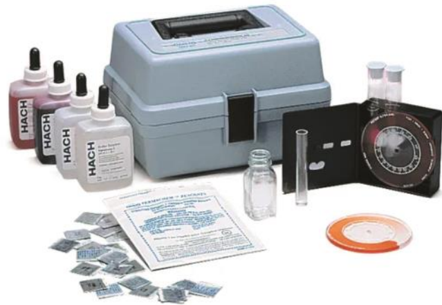
Water Testing & Analysis Kit