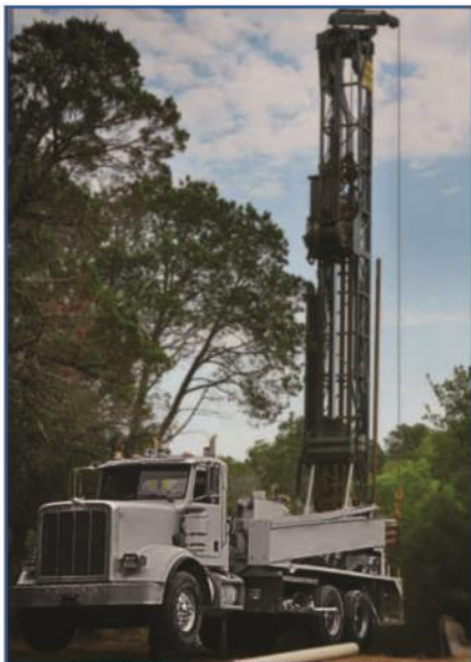
Pictured: Standard Well Digging Rig

NOTE: basic tests for Nitrates and Coliform Bacteria & E Coli are the only required parameters to be tested for a Real estate transaction.