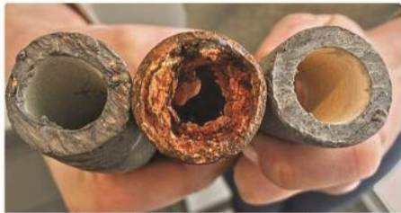
City water pipes - before and after.

As with everything these days, city water is becoming more expensive per gallon. Some are wondering about its quality as well. Is the quality improving, or staying stagnant?