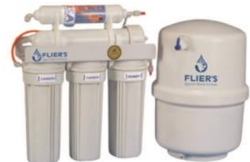
Undersink Reverse Osmosis Unit

Whether you're on a well, or city water, Flier's recommends that customers install a Reverse Osmosis system to feed a point of use faucet at the kitchen sink at home or in the office, and to feed your chilled water dispenser and ice maker in your refrigerator. This will cover 98% of your drinking water.