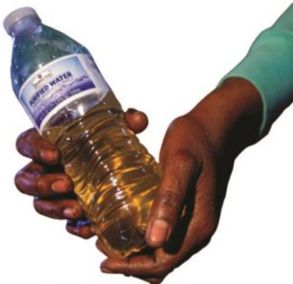
Example of discolored city water.

Why not be sure? Why worry about 'Boiled Water Advisories'? Why worry about possible bacterial contamination or toxic metals. Rather, rest easy knowing that 99% of all solids and contaminants are removed with Reverse Osmosis.