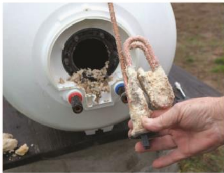
Water Heater Repair

Think of not having to haul all that salt down to the basement or into the mechanical room, dumping it, or disposing of the bags. Never running out again, not having to worry about what it does to your septic system, or filling out annoying environmental discharge reports to the waste water treatment plant.